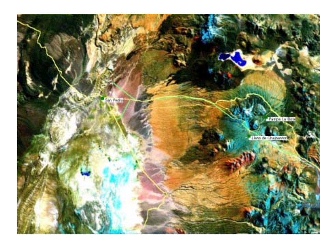
Figure 3: Loci of roads (yellow lines) and pipelines (green lines) overlaid on pseudo-color image of the Atacama area [9] synthesized with Landsat Thematic Mapper 1.6 \mu m (red), 1.0 \mu m (green) and 0.5 \mu m (blue) images. This pseudo-color image, which was kindly provided by Jennifer Yu and Bryan Isacks of the Cornell University Department of Geology and Jeremy Darling of the Astronomy Department, covers about 0.6° \times 0.9° (equivalent to about 60 km \times 100 km) area, roughly centered at 23° S and 68° W, and includes both the community of San Pedro de Atacama and Cerro Chascón science preserve area. Note that coordinates of the image are not accurately examined. Water and snow look bluish in this image. Positions of the site testing containers at Pampa La Bola and Llano de Chajnantor are also shown.